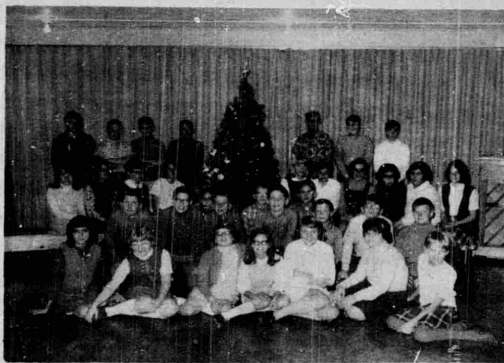
Trinity Lutheran Choir Sings to Shut-Ins

A total of $198,530.20 has been spread on the tax roll for Algoma Township and Mrs. Gray reports that approximately 3 1/4 percent has been collected during the first week.