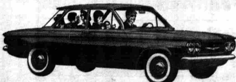
Corvair 700 4-Door Sedan (with handy fold-down rear seat)

No other car even came close to Corvair in this year's competition for Motor Trend magazine's Car-of-the-Year award. But unless you've ac- tually driven a Corvair—experienced its silken ride, light steering, grab-hold-and-go traction —you can't imagine how quick it really is to please. Your dealer's the man to see.