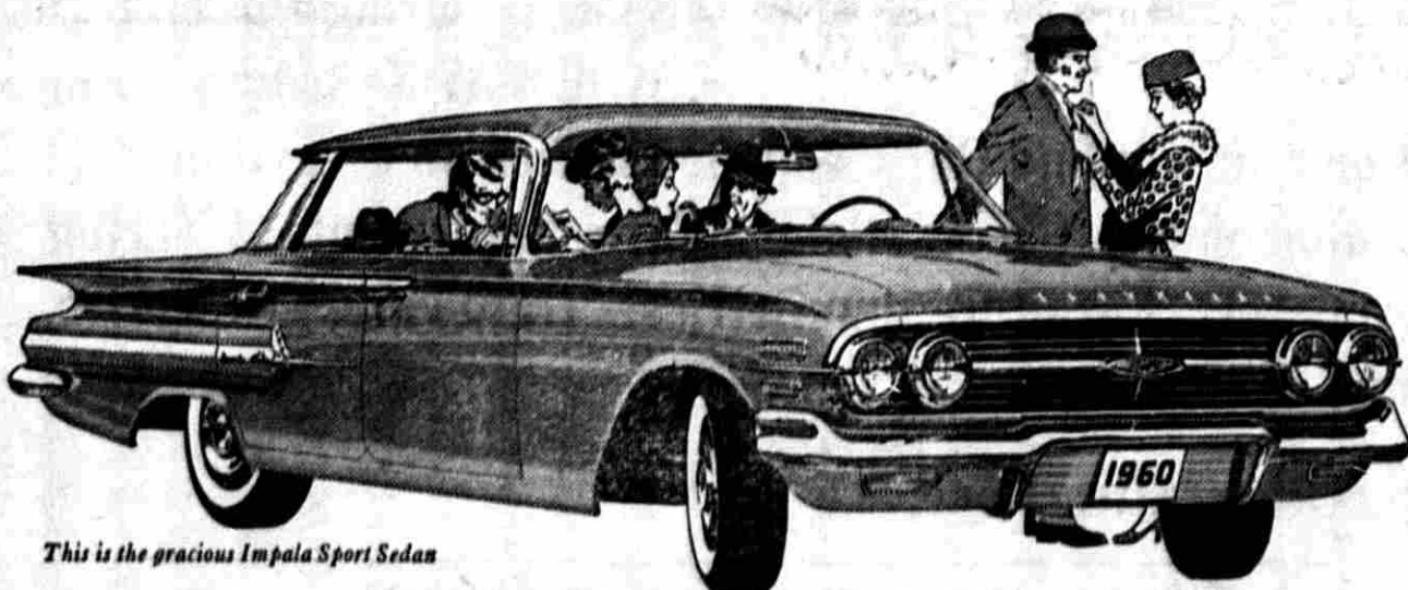
This is the gracious Impala Sport Sedan

Year's Best Seller at a Record Breaking Rate!